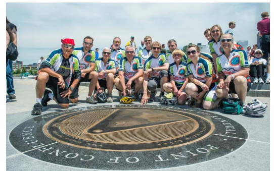
Point Made!