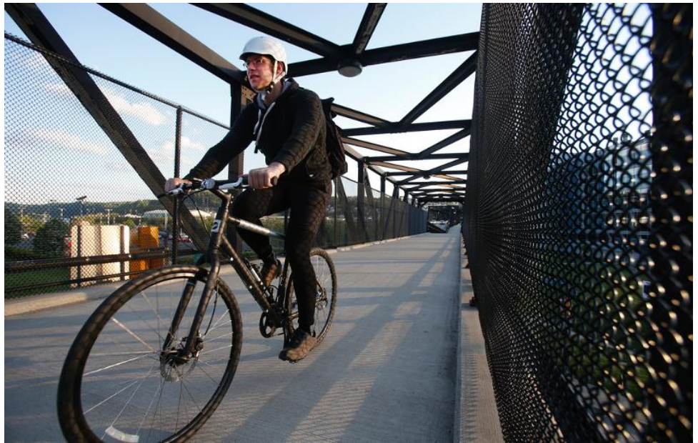
Commuter crosses the Hot Metal Bridge.