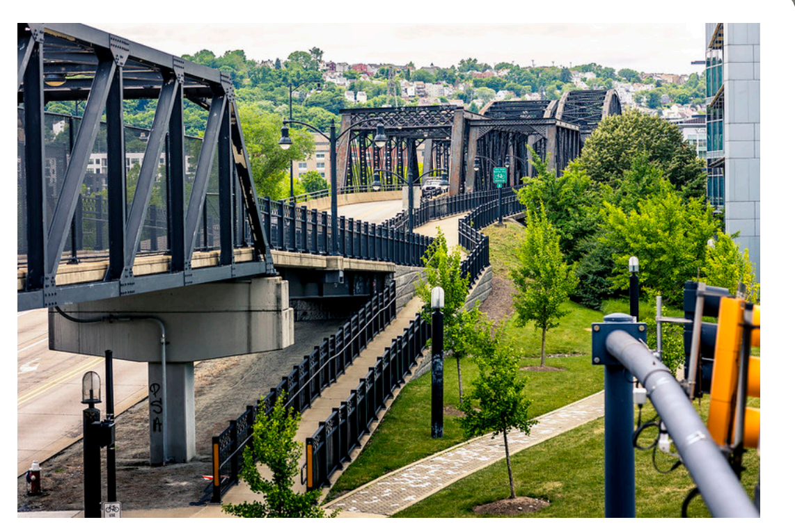
Hot Metal Bridge Example of a bicycle/pedestrian bridge and ramps in the City of Pittsburgh