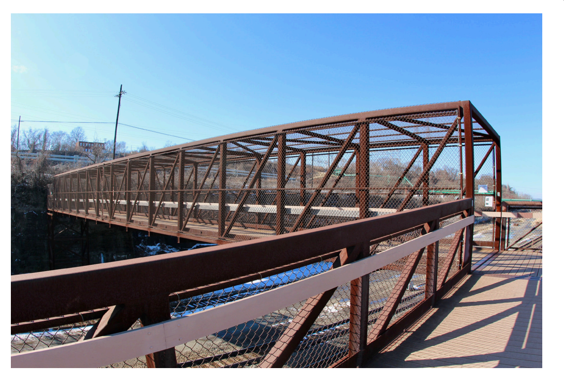
Port Perry Bridge Example of an elevated bridge along the Great Allegheny Passage

Bike/Ped Bridge Crossing to Duck Hollow Trail (across railroad tracks)