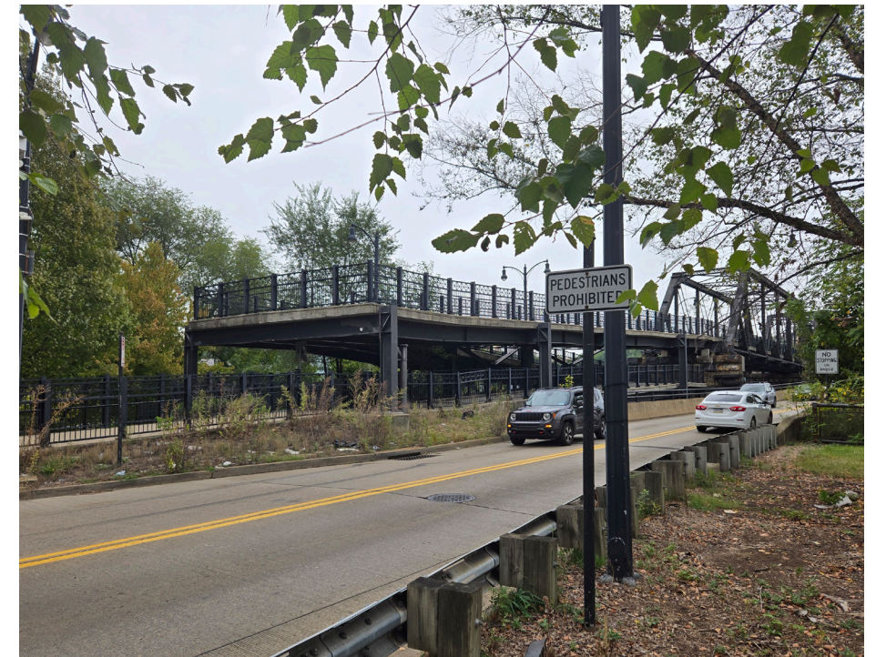
Example of multi-level ramp structure: Hot Metal Bridge, Pittsburgh