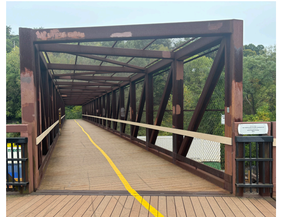
Example Structure: Whitaker Bridge, West Mifflin/Whitaker