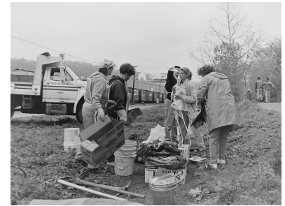
Volunteers at a riverside cleanup, Earth Day, 1991

Through broad and diverse collaborations, we continue to work towards and promote environmental restoration, economic vitality, and public health benefits for Allegheny County and Southwestern Pennsylvania.