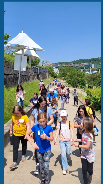
Youth programming on the trails